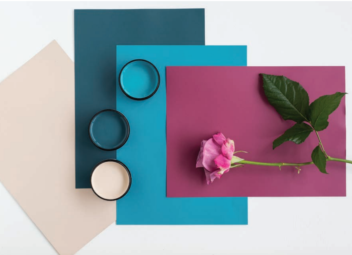
Drawdowns from left, RESENE Shabby Chic, RESENE Fast Forward, RESENE She'll Be Right and RESENE Love Me Do. Testpots in RESENE She'll Be Right (top), RESENE Fast Forward and RESENE Shabby Chic (bottom) from RESENE COLORSHOPS.