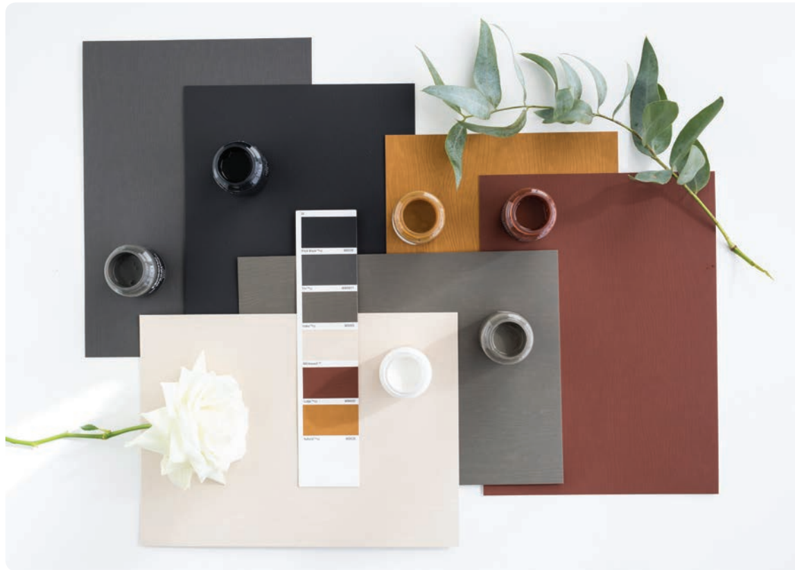
A beautiful collection. RESENE Colorwood stains from left, RESENE Colorwood Tiri, RESENE Colorwood Pitch Black, RESENE Colorwood Whitewash, RESENE Colorwood Iroko, RESENE Colorwood Natural and RESENE Colorwood Cedar from RESENE COLORSHOPS.