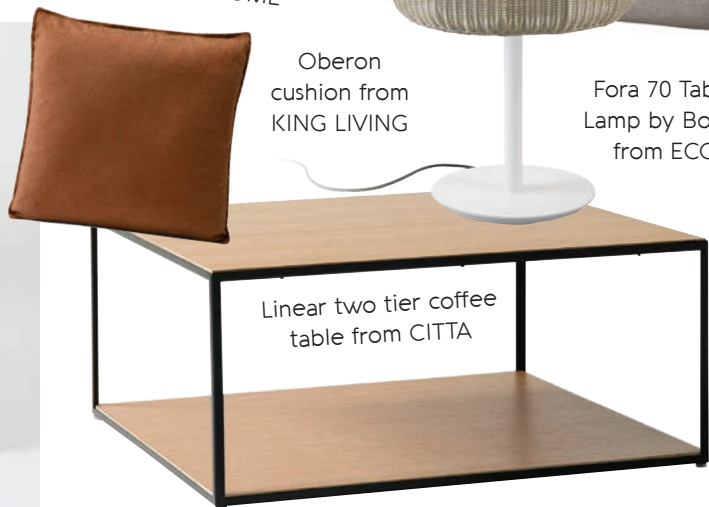
Linear two tier coffee table from CITTA