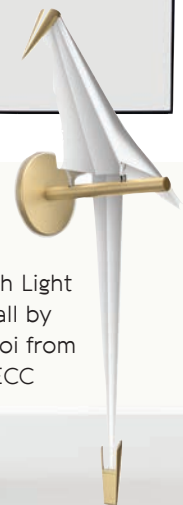
Perch Light Wall by Moooi from ECC