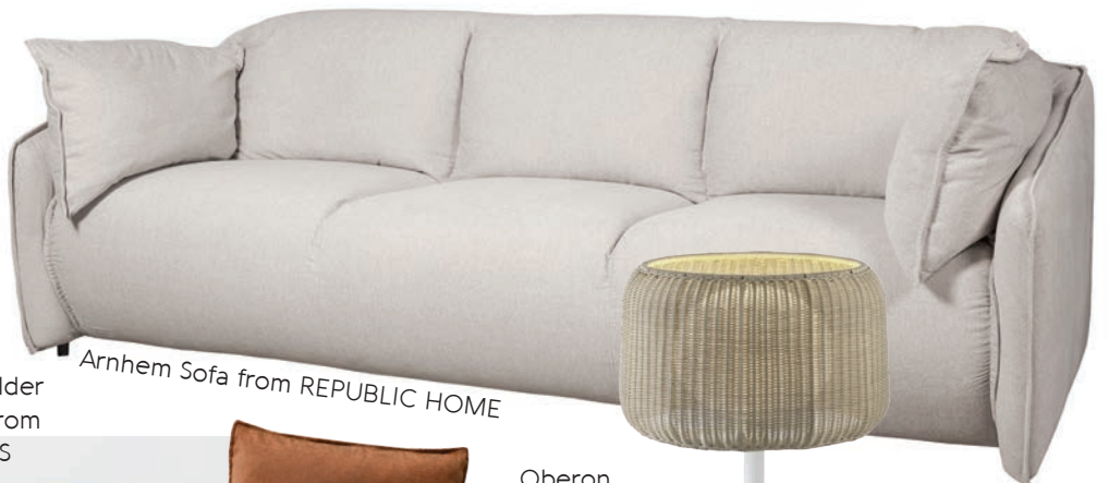
Arnhem Sofa from REPUBLIC HOME