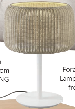
Fora 70 Table Lamp by Bover from ECC