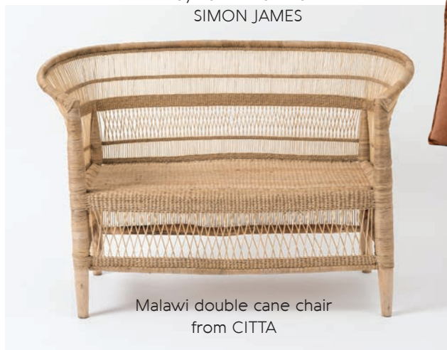
Malawi double cane chair from CITTA