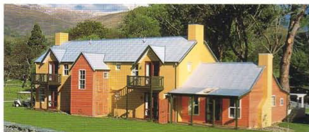
Timber walls: Resene Santa Fe