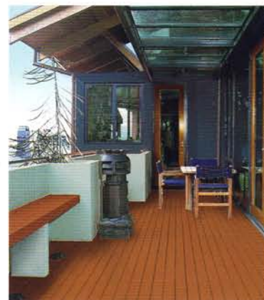
Deck: Resene Kwila Decking Stain; Wall: Resene San Juan; Deck wall: Resene Loblolly

Apply at least two full coats of Lumbersider allowing a minimum of two hours drying between coats. Decks will benefit from a third coat applied after the first summer season.