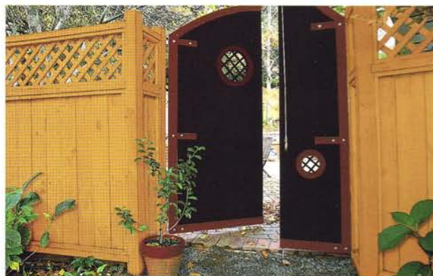
Fence: Resene Muddy Waters; Gate: Resene Wood Bark; Gate trim: Resene Burnt Crimson

CAUTION: Sanding dust from some hardwoods is considered carcinogenic and all timber sanding dusts should be considered potentially harmful. Always wear an efficient dust mask.