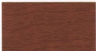
Dark Rimu™ WD 10CW16