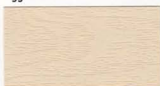
Rock Salt™ (blonding) 10CW25