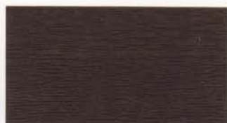
Deep Oak™ WD 10CW10