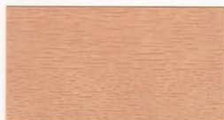
Peach Schnapps™ 10CW29