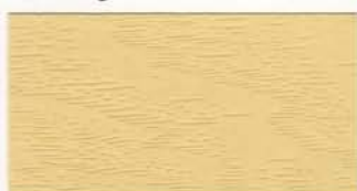
Creme De Banane™ 10CW23