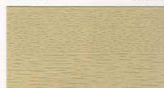
Pea Soup™ 10CW41