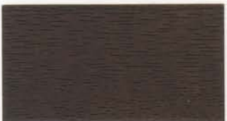
Blackwood™ WD 10CW11