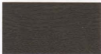
Black Pepper™ 10CW38