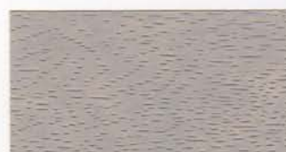
Pigeon Post™ 10CW36