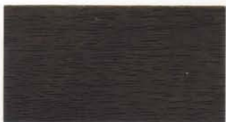
Dark Ebony™ 10CW14