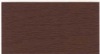
Teak™ WD 10CW12