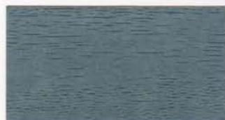
Deep Cove™ 10CW34