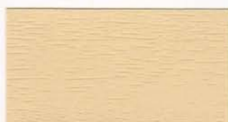
Egg White™ 10CW24