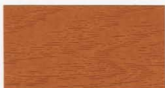
Oregon™ WD 10CW21