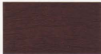
Mahogany™ WD 10CW30