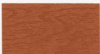
Red Beech™ WD 10CW20