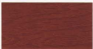
Meranti™ WD 10CW15