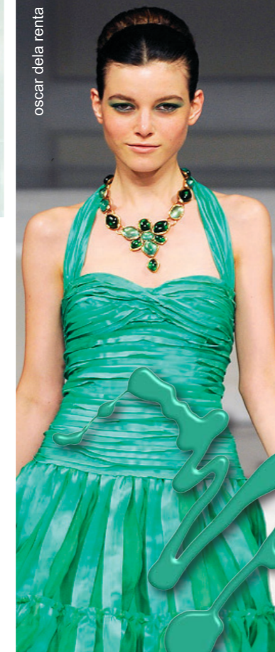
oscar dela renta