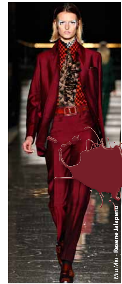
Miu Miu - Resene Jalapeno