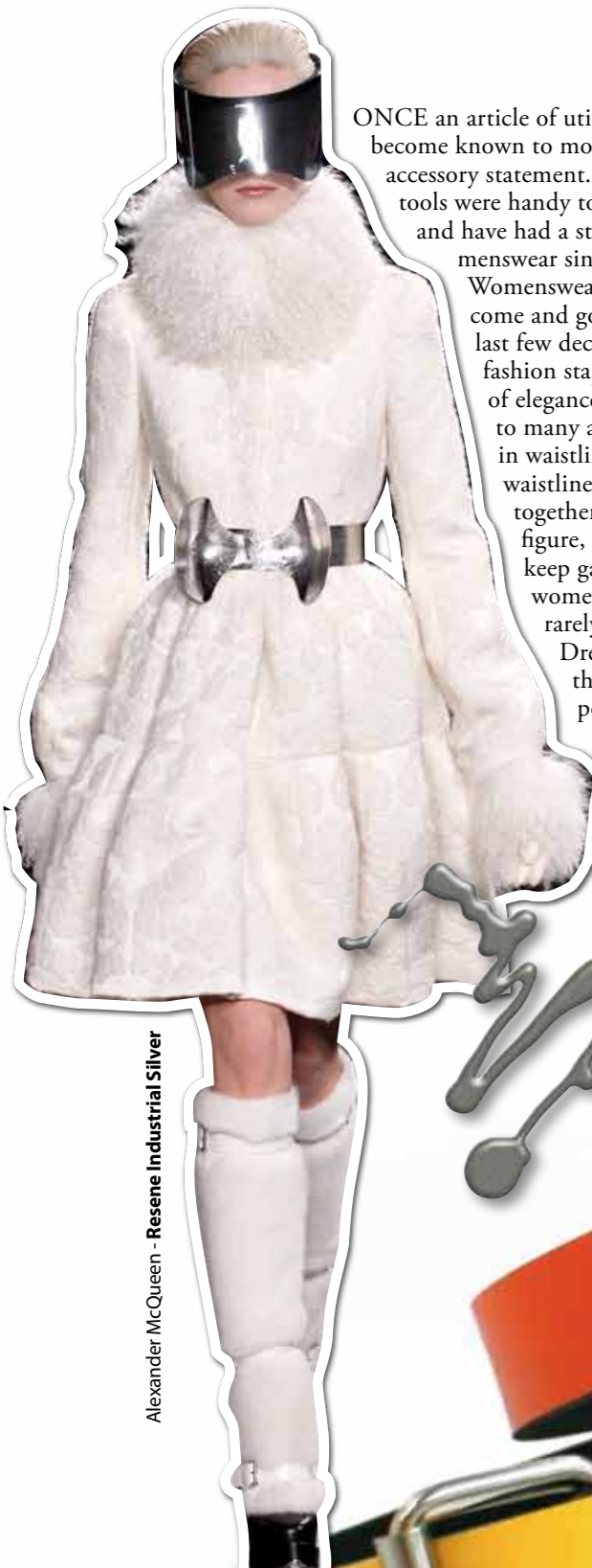
Alexander McQueen - Resene Industrial Silver

ONCE an article of utility, belts have now become known to most as a fashionable accessory statement. Belts packed with tools were handy to every carpenter and have had a strong presence in menswear since the Bronze Age. Womenswear has seen belts come and go, and only in the last few decades has become a fashion staple. Adding a touch of elegance and sophistication to many an outfit, cinching in waistlines, accentuating waistlines, joining garments together, flattering a fuller figure, and no doubt to keep garments in place, womenswear belts are very rarely seen as utility belts. Dream interpreters claim that a belt symbolises power especially a rather ornate one. In fact according to Garuda's Dream Dictionary; finding a belt could mean you