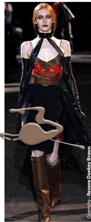
Givenchy - Resene Donkey Brown