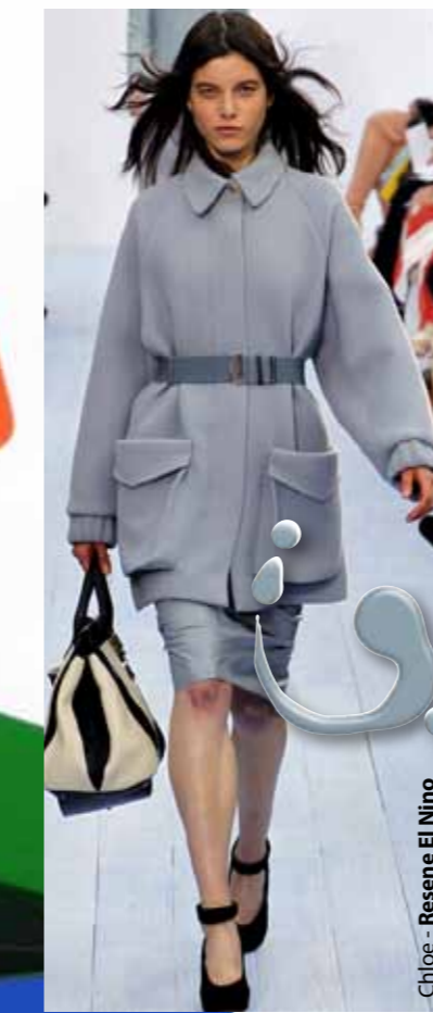
Chloe - Resene El Nino