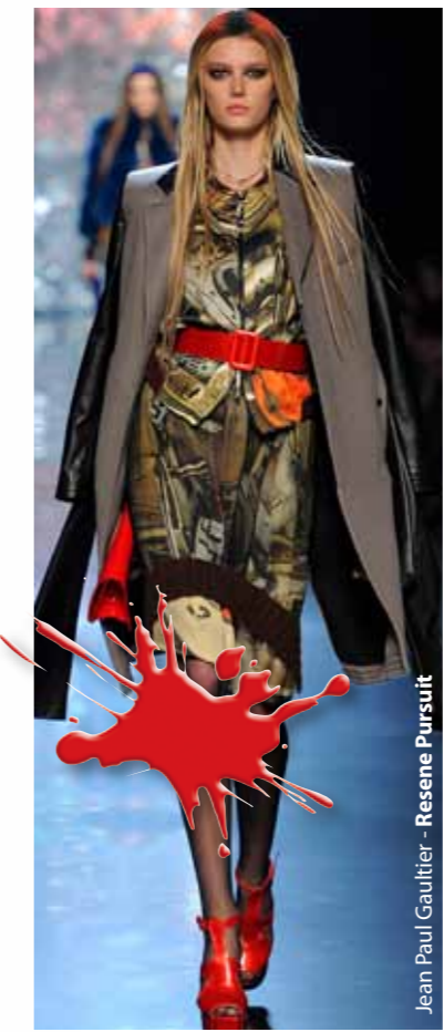
Jean Paul Gaultier - Resene Pursuit