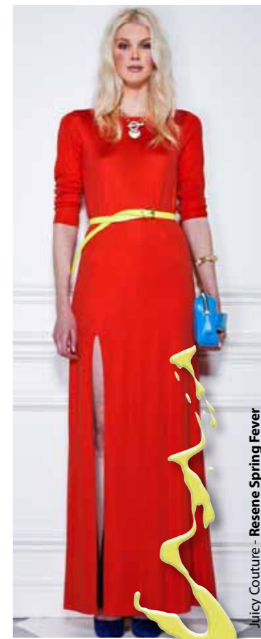
Juicy Couture - Resene Spring Fever