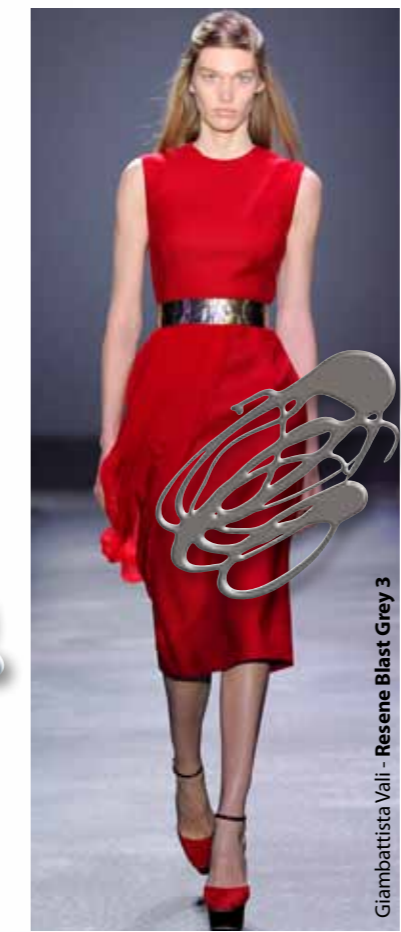
Giambattista Vail - Resene Blast Grey 3