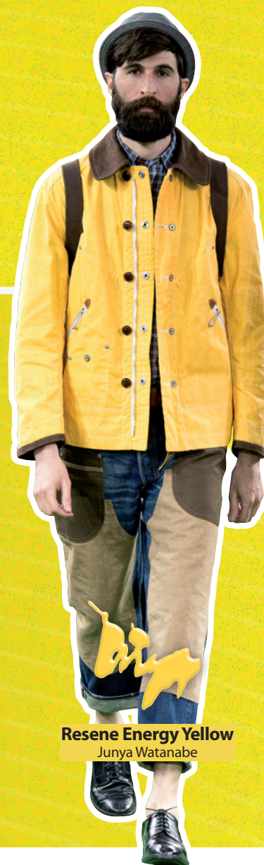
Resene Energy Yellow Junya Watanabe