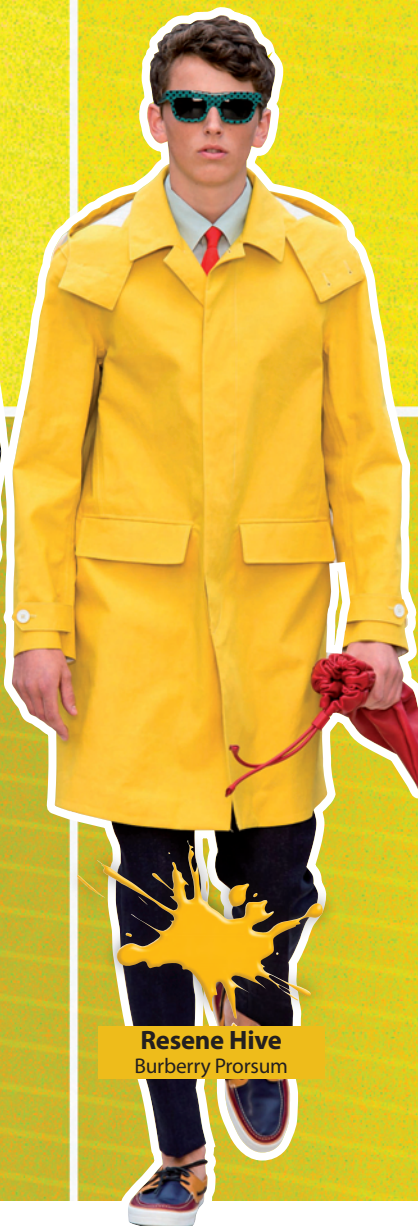
Resene Hive Burberry Prorsum