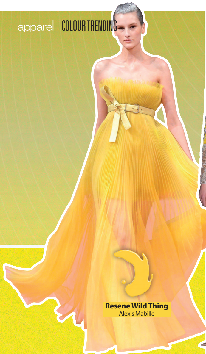
Resene Wild Thing Alexis Mabille