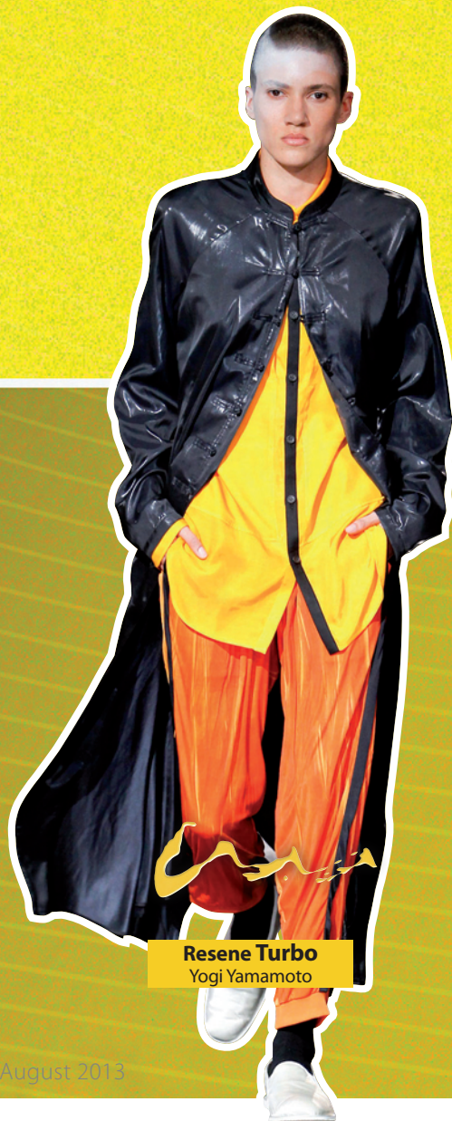
Resene Turbo Yogi Yamamoto