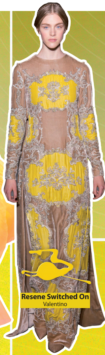
Resene Switched On Valentino